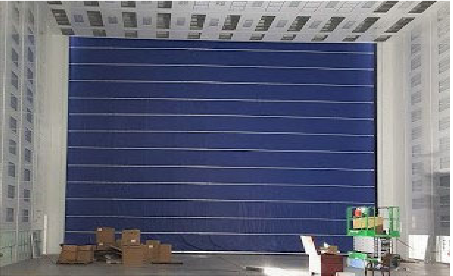
MAXDoor HD 50-ft wide x 50-ft high