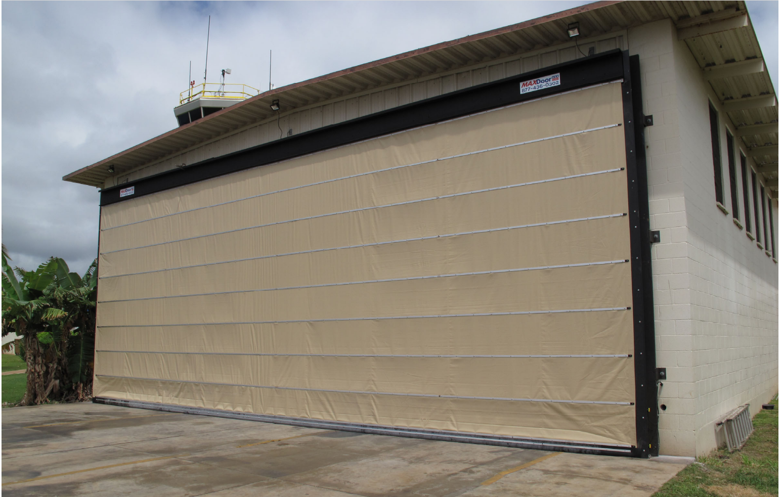
MAXDoor HD 45' wide