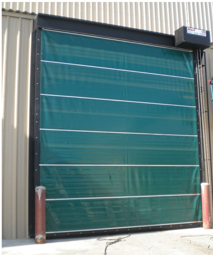
MAXDOOR HD Installed at Hard Wood Kiln 100% Humidity