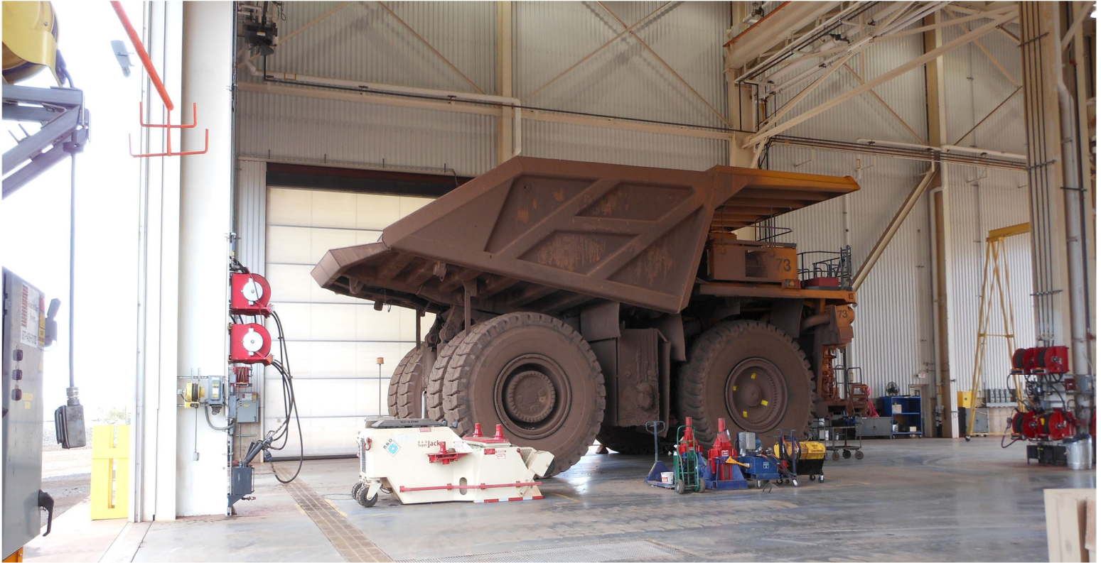
MINING TRUCK SHOP MAXDOOR HD with White High Visibility Fabric